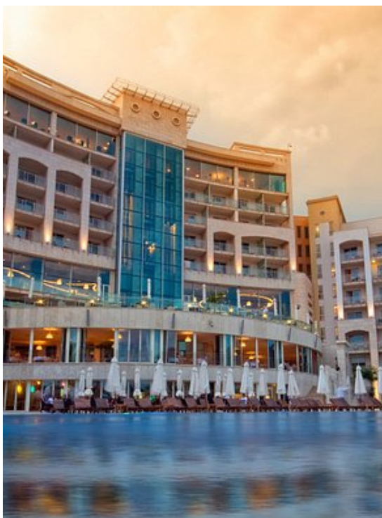
Hotel Splendid, Budva, Montenegro

It is my prayer this year that we will 'see Him more clearly, love Him more dearly, and follow Him more nearly, day by day' (adapted from Richard of Chichester).