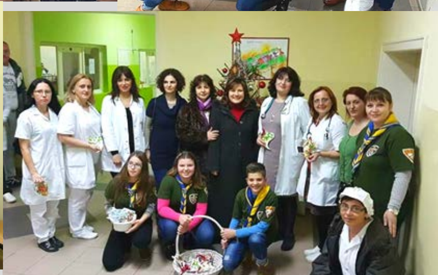
FROM WHATNOT WORKSHOPS TO THE CENTER OF INFLUENCE - MENTAL AND EMOTIONAL HEALTH SEMINARS AND HUMANITARIAN ACTIONS