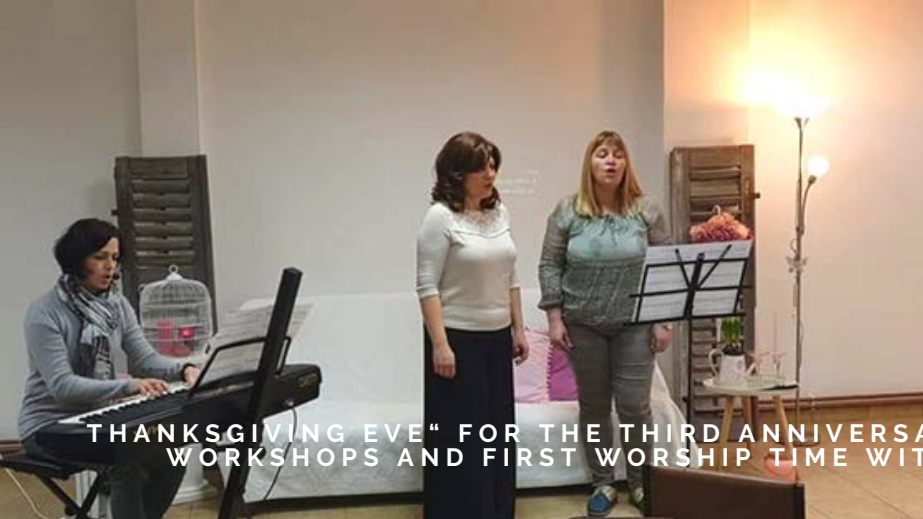
THANKSGIVING EVE" FOR THE THIRD ANNIVERSARY OF THE WHATNOT WORKSHOPS AND FIRST WORSHIP TIME WITH AGAPE DINNER