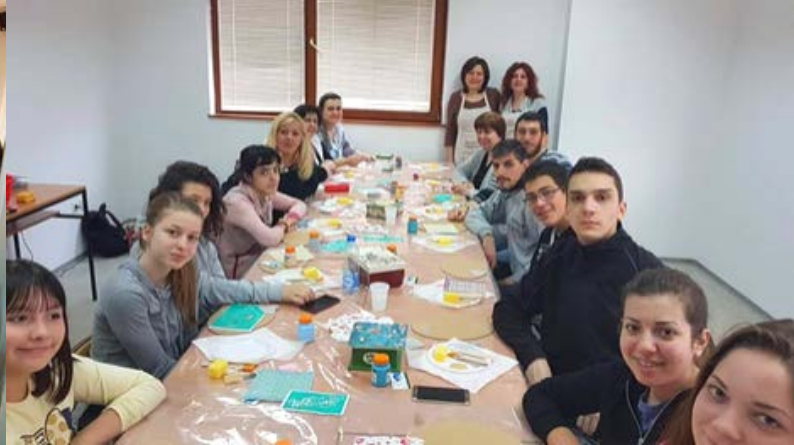
GIFT BOXES FOR THE PATIENTS AT THE ONCOLOGY WARD OF THE TOWN HOSPITALS IN PARAĆIN AND ČUPRIJA MADE BY THE WM AND SOUTH CONFERENCE YOUTH DEPARTMENT