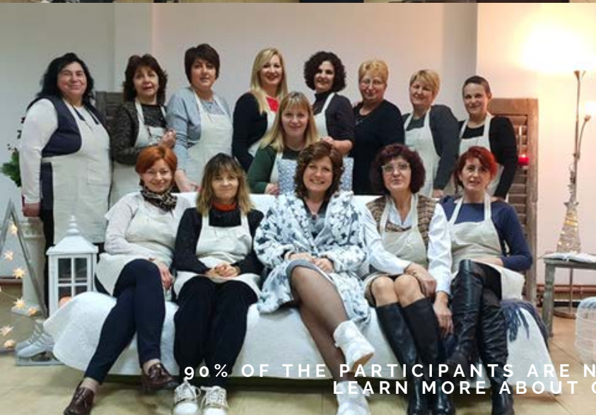
90% OF THE PARTICIPANTS ARE NON-ADVENTIST WOMEN READY TO LEARN MORE ABOUT GOD AND SDA CHURCH