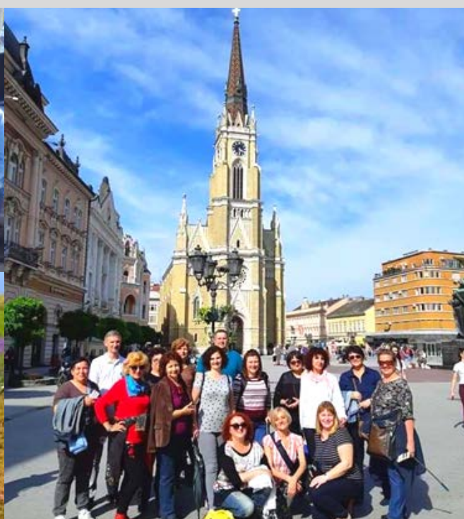
FROM WHATNOT WORKSHOPS TO THE CENTER OF INFLUENCE - TRIPS, EXCURSIONS, JOURNEYS