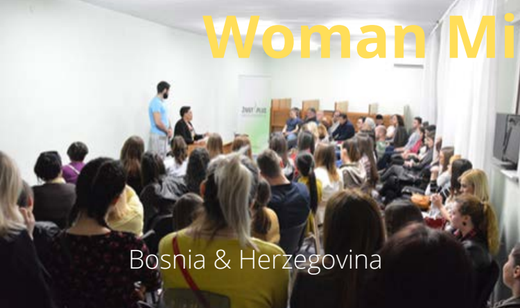
Bosnia & Herzegovina