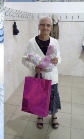
Two of the ladies who have received cushions