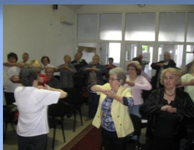
Cooking School and Exercise School activities in WM Wellness clubs in Novi Sad and Temerin, Serbia