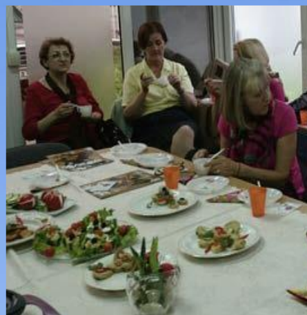
Food preparation and gustation