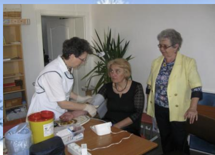
Health School and Bible School, as a part of the WM Wellness clubs activities in Novi Sad and Temerin