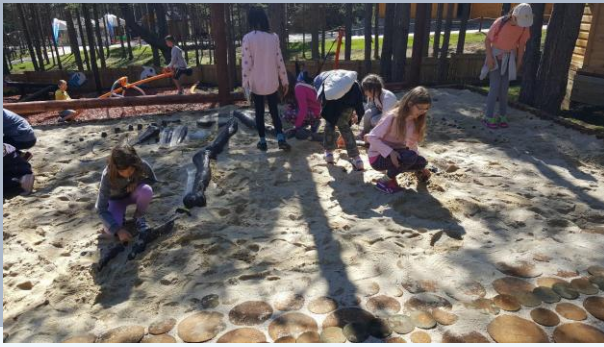
Looking for fossils