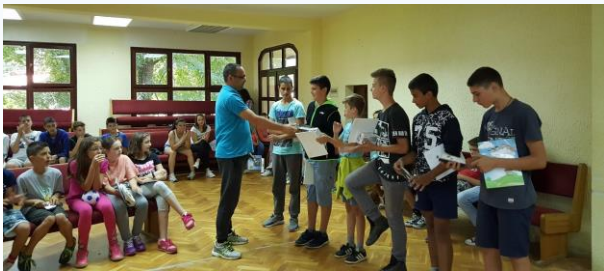
At the end of the camp we had an award ceremony