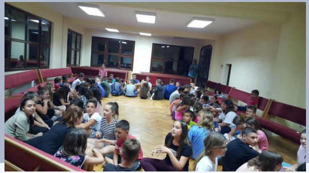
In the evening before we played together