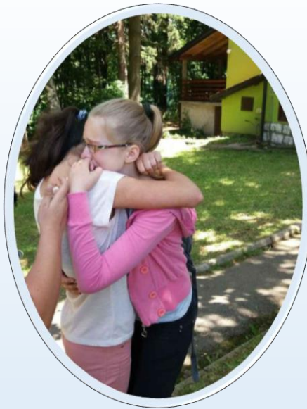
And this was the most difficult time when children needed to say good bye