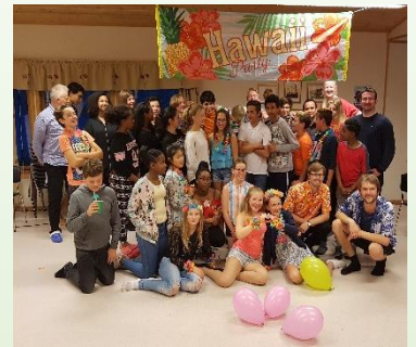
Teen programmes in the North