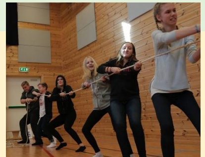
Teen programmes in the South