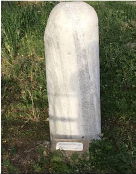
Plaque reads: 'St. Paul's Pillar', Paphos, Cyprus

*St. Paul's pillar, Paphos – caution required that this is the exact pillar etc.