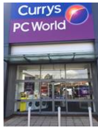
Photo: Currys PC World, Coventry, West Midlands (Photo: David Neal)

For quite a long time now, we've lived in the age of the instant. Remember the time when messages were hand or type-written on paper, placed in an envelope, and posted in a letterbox. Delivery time was, at best, next day.