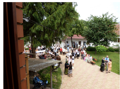
Potluck at church on Sabbath afternoon.

liked about the project was that they not only run the camp in the summer but visit the children during the year, thus keeping contact with them.