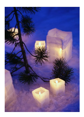
Let our lights shine

Matthew 5:14 You are the light of the world. A town built on a hill cannot be hidden