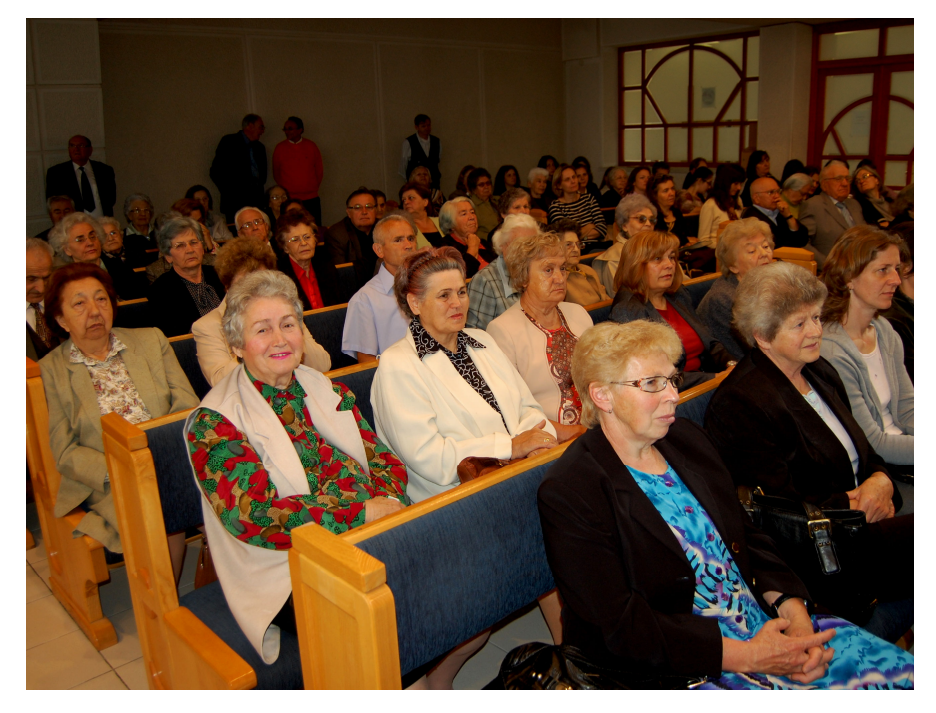
Some of the women in Novi Sad