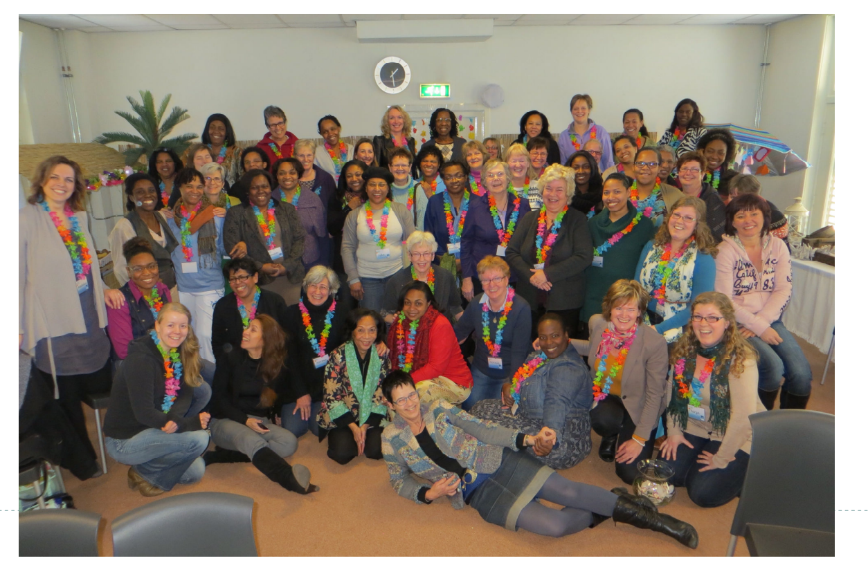
Seaside Escape weekend in Netherlands