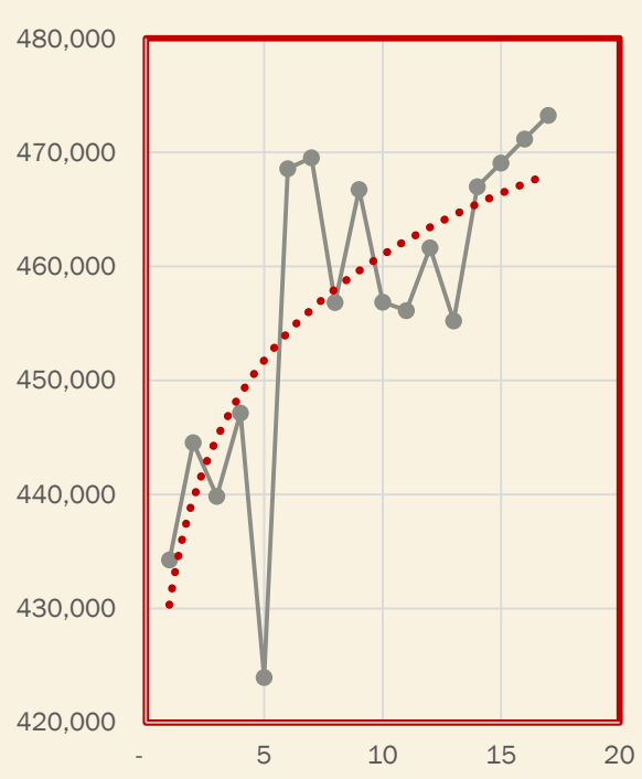
Rolling 12 Month by Quarters

Project the Tithe Graphically Choose Linear, Logarithmic or Polynomial Trend.