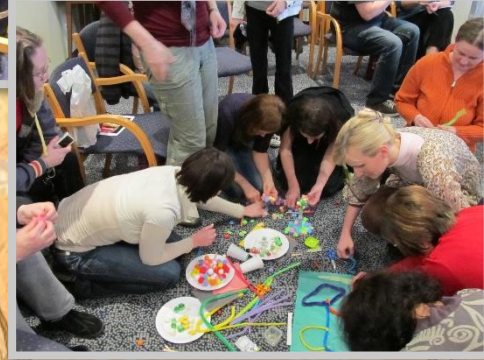
Children's Teachers training